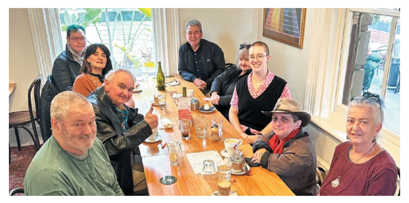
Above: VRAC and the Community Development and Engagement Team.