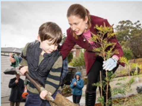
Above: Federal Minister for Housing and Homelessness, Julie Collins helping a resident plant a tree.

During Homelessness Week in August, Housing Choices Tasmania residents were joined by a range of government officials, including Federal Housing Minister Hon Julie Collins, State Housing Minister Guy Barnett and Tasmanian Senator Carol Brown, as well as Housing Choices staff and guests to formally launch two architecturally designed social and affordable housing projects in the state's south.