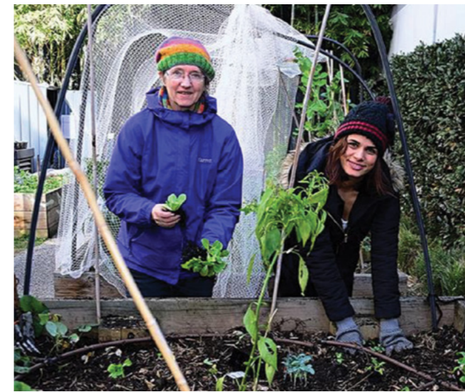
One of the many photographs taken by Guru during gardening days at Chetwynd Street.

apartment at North Melbourne. They moved into their new home in October 2012 and love its central location.